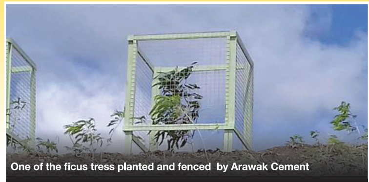
One of the ficus trees planted and fenced by Arawak Cement